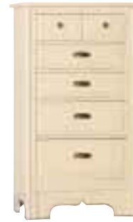
5395 5 DRAWER NARROW CHEST