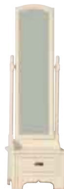
5372 CHEVAL MIRROR