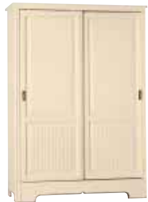
5383 WARBROBE 2 SLIDING DOORS

5370/4 4'6" W 150 (59.5) D 203 (80) H 123 (48.5) 5370/5 5'0" W 165 (65) D 211 (83.5) H 123 (48.5) 5370/6 6'0" W 195 (77) D 211 (83.5) H 123 (48.5)