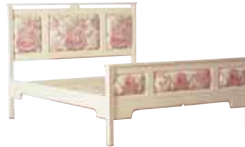
BED FRAME UPHOLSTERED WITH SLATTED BASE (F)

5367/3 3'0" W 104 (41) 5367/4 4'6" W 150 (59.5) 5367/5 5'0" W 165 (65)