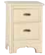
5391 2 DRAWER NIGHT TABLE