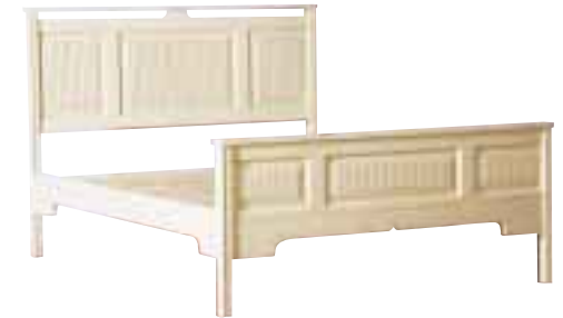
BED FRAME WITH SLATTED BASE

5370/4 4'6" W 150 (59.5) D 203 (80) H 123 (48.5) 5370/5 5'0" W 165 (65) D 211 (83.5) H 123 (48.5) 5370/6 6'0" W 195 (77) D 211 (83.5) H 123 (48.5)