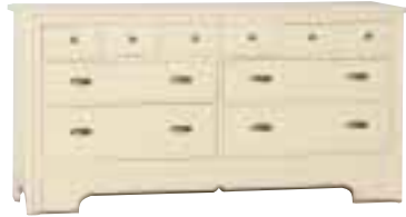
5389 7 DRAWER LONG CHEST