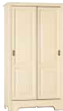
5381 WARBROBE 2 SLIDING DOORS