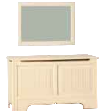
5238 MIRROR 5390 BLANKET BOX

W 100 (39.5) W 104 (41) D 3 (1.5) D 43 (17) H 70 (28) H 60 (24)