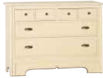
5384 4 DRAWER CHEST