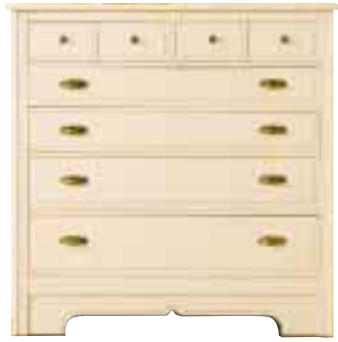
5387 6 DRAWER HIGH CHEST