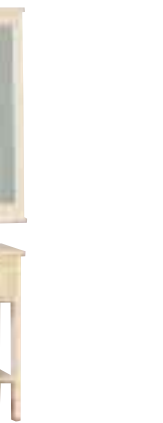
5121 LAMP TABLE