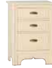
5392 3 DRAWER SMALL CHEST